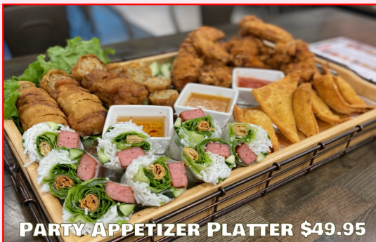
PARTY APPETIZER PLATTER $49.95