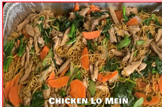
CHICKEN LO MEIN