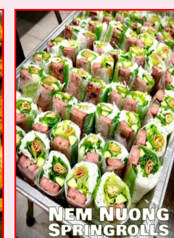
NEM NUONG SPRINGROLLS